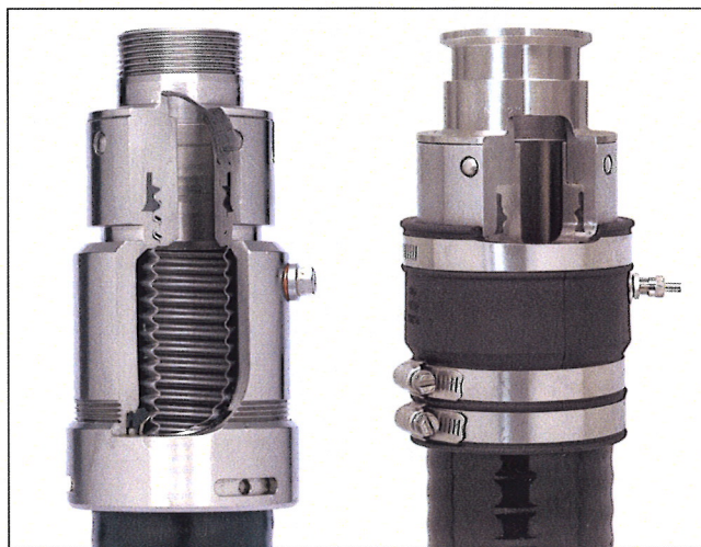
Closed end fitting

FLEXWELL®-HL is available with an ID of 1" (ND 25) to 3" (ND 80) for conventional use at an operating pressure of up to 145 PSIG (10 bar) and temperatures between - 50 °C (- 58 °F) to + 50 °C (+122 °F). For gases such as LPG, FLEXWELL-LPG single-walled pipe can be operated at up to 360 PSIG (25 bar).