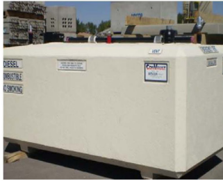
ConVault Fuel Storage tank encased in 6 inches of precast concrete