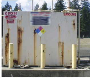
Rusted Steel fuel tank

ConVault offers an exclusive 30 year written Limited Warranty vs. the steel guys who only offer a 1 year written Limited Warranty. ConVault, Inc. warrants each tank against defects in material or workmanship to the original owner from the date of purchase, for a period of twenty (20) or thirty (30) years depending on model number of the tank. ConVault agrees to repair or replace any defective unit without charge provided that the tank is operated and maintained in accordance with the manufacturers Owners Manual.